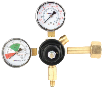
3741 (Zinc Bonnet)

Taprite Regulators have the highest flow rate in the industry! Robust design delivers performance, reliability, and is unlikely to experience freeze up issues. Extremely durable and user friendly, polycarbonate bonnets make adjustments a snap! Pull the cap to adjust the pressure and push back to lock it in.